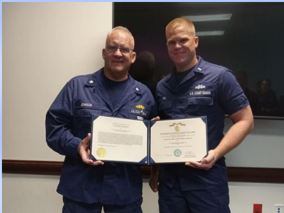
LTJG Hill Award