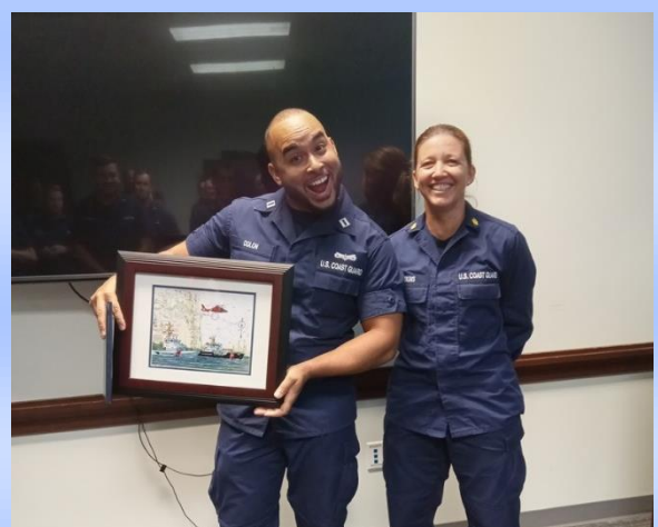
LT Colon Departure Gift